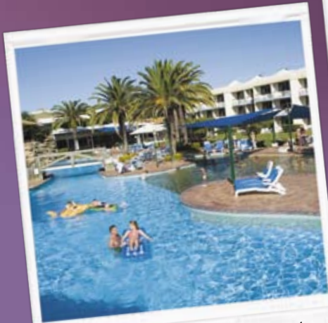
Relax by our pool or enjoy the slides at our NEW Water Park