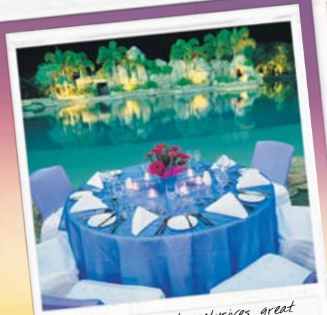
Special theme park exclusives, great team building opportunities plus incredible offsite dining experiences.