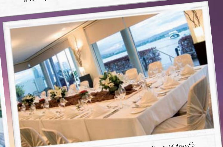
Nine unique conference venues including the Gold Coast's only true waterfront facility - The Presidential Room.